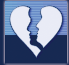
Validation Training Institute