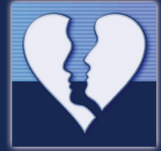
Validation Training Institute